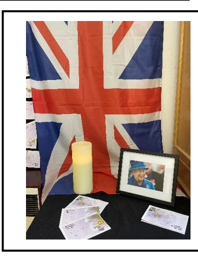
"Your family are all in our thoughts – we love you" -Quote from student at Meole Brace School